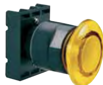
8 LP2T BL6245