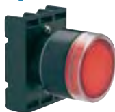
8 LP2T BL104