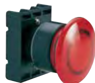
8 LP2T BL6144