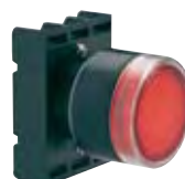
8 LP2T QL104