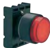
8 LP2T QL204